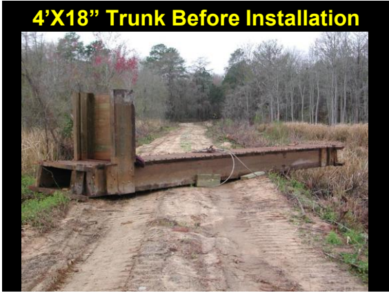
4'X18" Trunk Before Installation