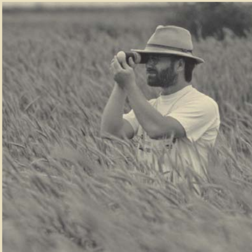
Researcher/Ducks Unlimited Canada

Because there is a rich scientific history and extensive practical management experience concerning waterfowl, Plan partners are fortunate to have a broad scientific knowledge base on which to build conservation plans. This knowledge varies greatly, however, among species and regions. For instance, we know a great deal more about mid-continent mallards than we do about king eiders in the central Arctic or masked ducks in Mexico. Managers are challenged to make conservation investments in the face of much uncertainty about the impact of their actions on waterfowl populations. Plan partners are challenged to improve the scientific knowledge on which conservation decisions depend and to continuously improve their work through adaptive management.