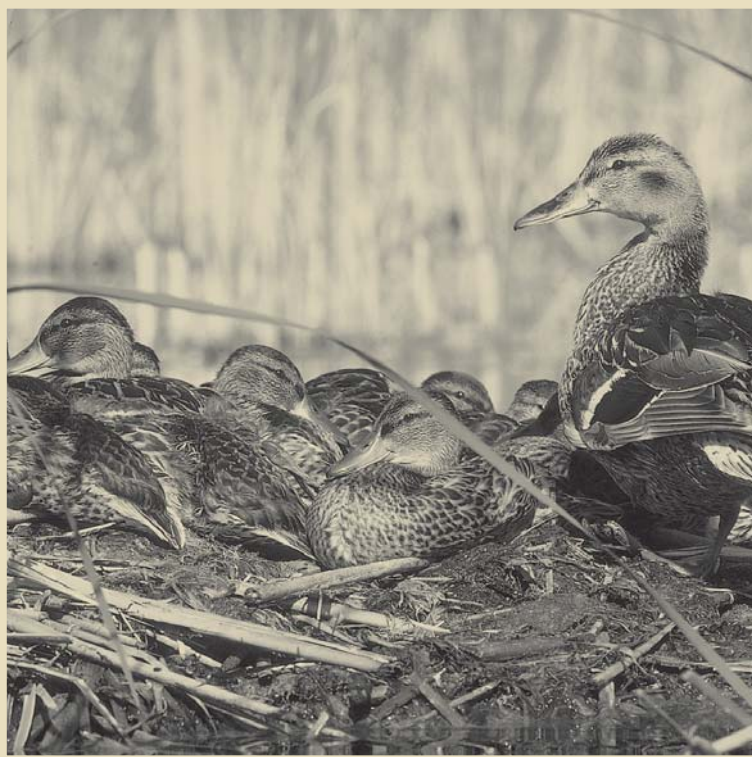
Mallards