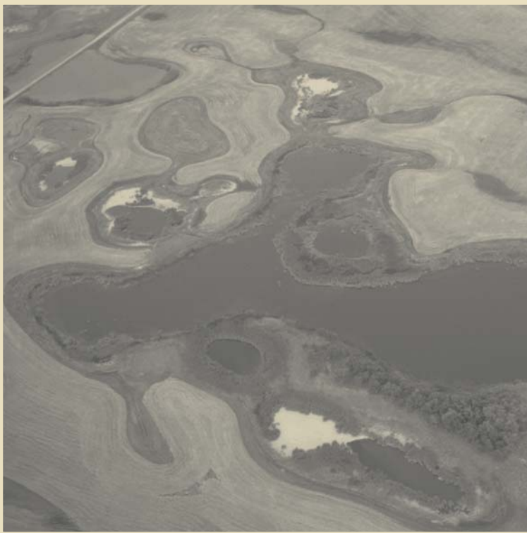
Prairie Pothole Region/Ducks Unlimited Canada

critical habitat conservation needs for waterfowl. As the biological foundation for waterfowl conservation has grown, and as Plan horizons have expanded to embrace the full spectrum of North American waterfowl, additional priority areas in all three countries have been identified as critical to the continued maintenance of ducks, geese, and swans throughout their annual cycles (Figure 1). While habitat conservation and monitoring are important in every area of the continent, these areas require special attention and resources.