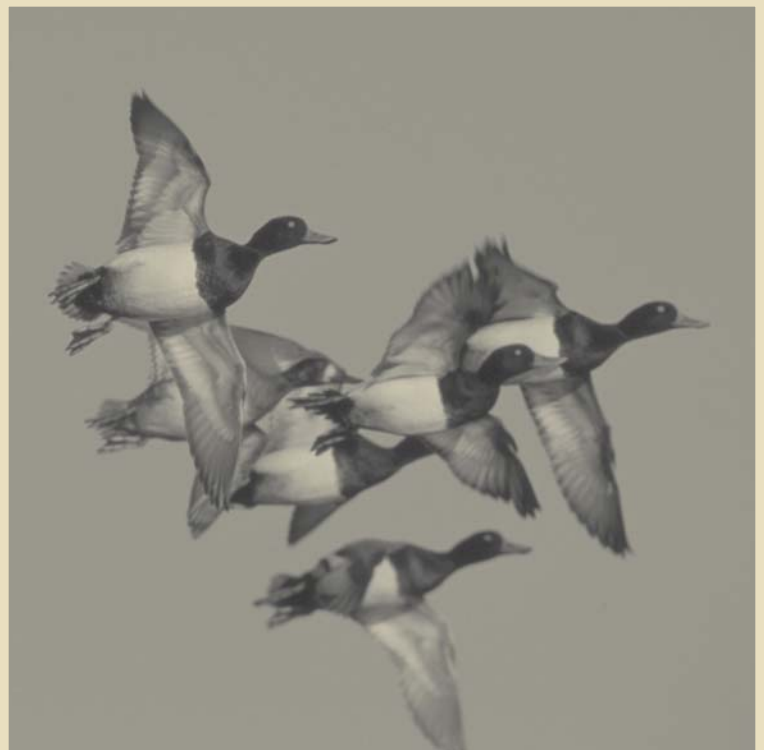
Lesser scaup

Improving the cost-effectiveness of Plan actions, and strengthening the scientific underpinnings of waterfowl plans, are key to maintaining the Plan's leadership role in conservation.