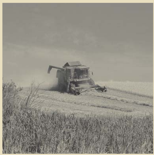
Farming/Ducks Unlimited Canada/ Darrin Langhorst

For more than 100 years, waterfowl conservation in North America has adapted to changing environmental, economic, social, and political forces. Continuing fundamental shifts in these forces, especially the trend toward the globalization of human society, demand the constant attention of Plan partners. These external factors can have substantial impacts, both positive and negative, on the landscapes supporting North American waterfowl.