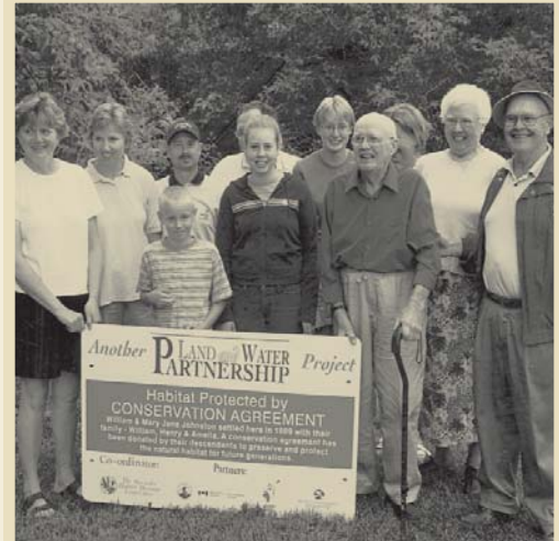
Manitoba easement dedication/ Manitoba Habitat Heritage Corporation

The results of this comprehensive assessment will help the Plan Committee and its partners set the stage for the 2009 Update, helping to clarify future priority needs. The results should also provide powerful incentive for financial supporters of the Plan to continue their aid.