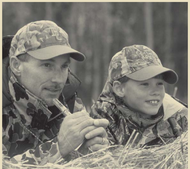
Duck calling/Ducks Unlimited Canada

Joint ventures and the Plan Committee must uphold a productive relationship in the future. The success of the Plan requires that these crucial waterfowl partnerships be renewed and invigorated.