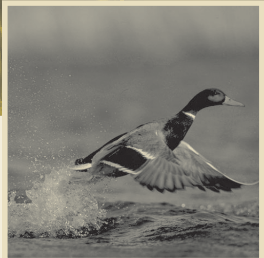
Mallard/Ducks Unlimited Canada

It was issues concerning waterfowl that drew Canada, the United States, and later, Mexico, into a continental conservation effort through the Plan and fostered conservation partnerships encompassing diverse sociological, economic, and environmental interests. Following the Plan model, managers of other bird groups, such as shorebirds, landbirds, and waterbirds, have developed their own geographically based plans with population goals that can be translated into conservation actions on the ground. The Plan community, which is defined as all the agencies, organizations, groups, and individuals involved in Plan activities, must now reaffirm its basic commitment to the science and conservation of waterfowl and their habitats while participating in broader stewardship efforts for other birds and the global environment.