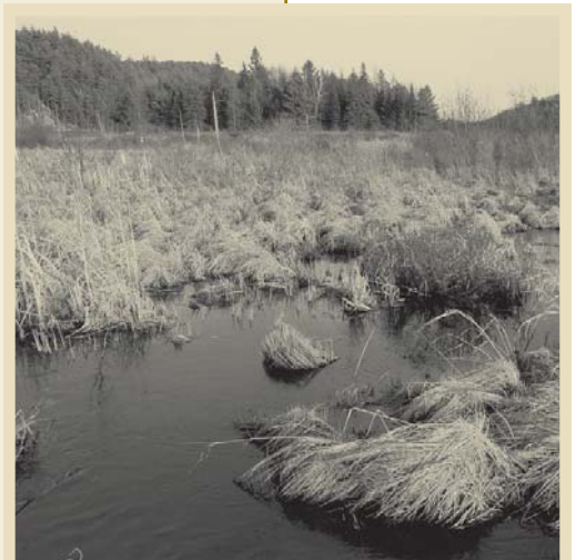
Boreal Fen

The purpose of the Plan is to sustain abundant waterfowl populations by conserving landscapes, through partnerships that are guided by sound science.