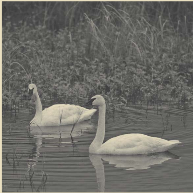
Trumpeter swans

The composition of the 2004 North American Waterfowl Management Plan began in June 2001. Since then, many individuals and organizations in Canada, Mexico, and the United States have contributed their ideas, time, and support to this effort. The Plan Committee gratefully acknowledges all who have participated in the process, especially those individuals listed below.