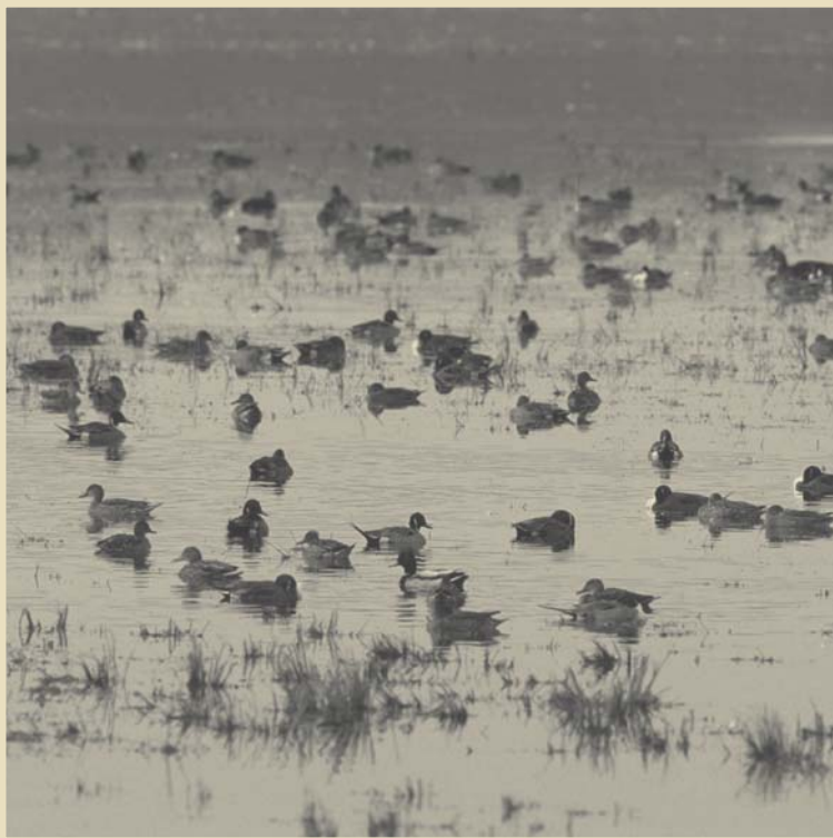
Northern Pintail

Consistent with the 1986 Plan, breeding duck population objectives are derived from average breeding population levels of the 1970s or subsequent species-specific management plans (Table 1). During the 1970s wetland conditions in the prairie-parkland region vital to breeding ducks ranged from fair to good. Duck populations during this decade were generally thought to meet the demands of both consumptive and non-consumptive users. Of the 14 species, species groups, or races of ducks for which goals have been established, 11 presently have stable or increasing long-term trends in abundance. Population objectives have not been established for other ducks because of inadequate monitoring programs or a lack of consensus on desired population levels.